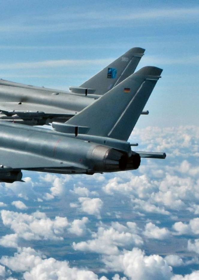
NATO's Baltic Air Policing mission