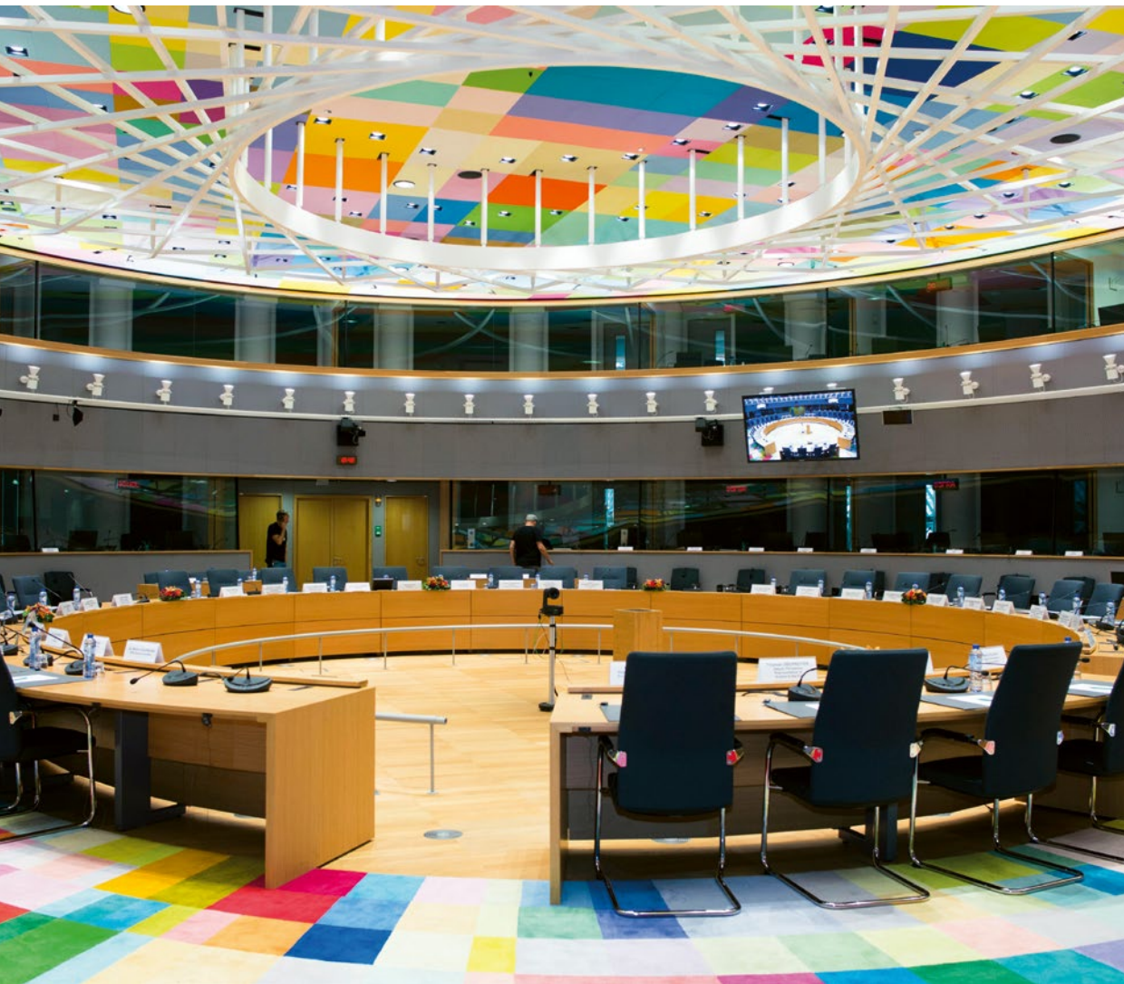
The meeting room of the European Council in Brussels