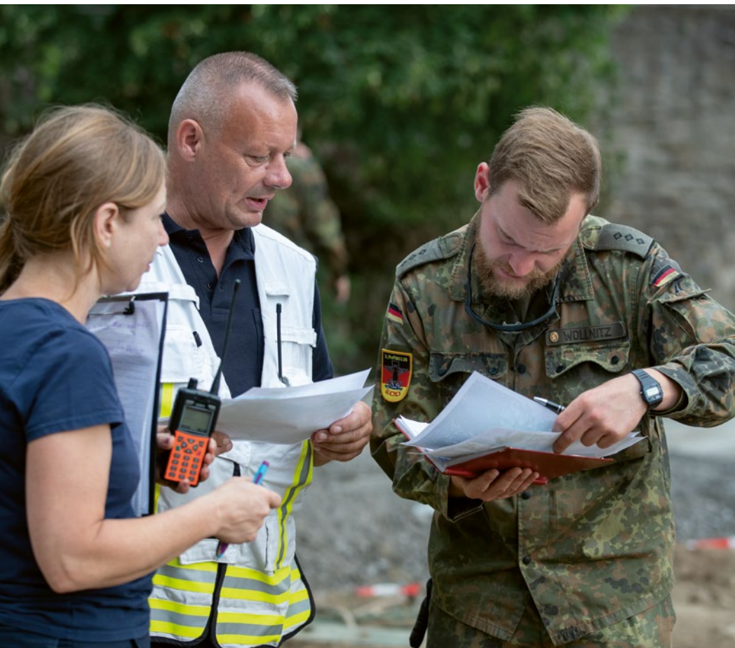
The Bundeswehr supported clean-up efforts after the devastating floods in the Ahr valley.