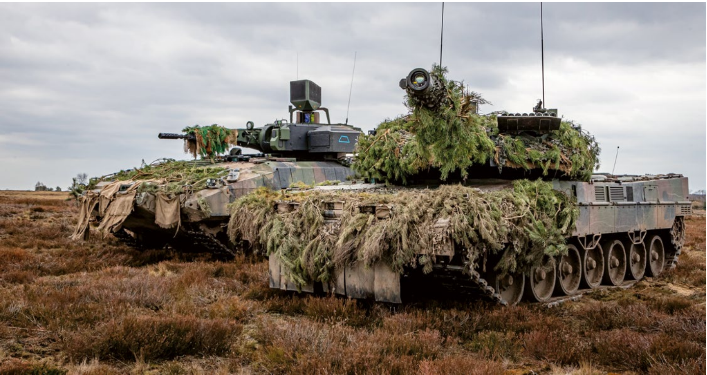
The Bundeswehr's Puma infantry fighting vehicle and Leopard battle tank

Credible deterrence and defence capability in the transatlantic alliance of NATO is the indispensable foundation of German, European and transatlantic security. NATO is the primary guarantor of protection against military threats. It links Europe and North America politically. The purpose of the Alliance is to protect the people in its territory and to defend our security, our values and our democratic way of life. We stand resolutely by our mutual defence pledge under Article 5 of the North Atlantic Treaty. Our commitment to NATO and to our obligations within the Alliance is unshakeable, as is our commitment to the EU's mutual assistance clause in Article 42 (7) of the Treaty on European Union and our mutual assistance commitment with France under Article 4 of the Treaty of Aachen.