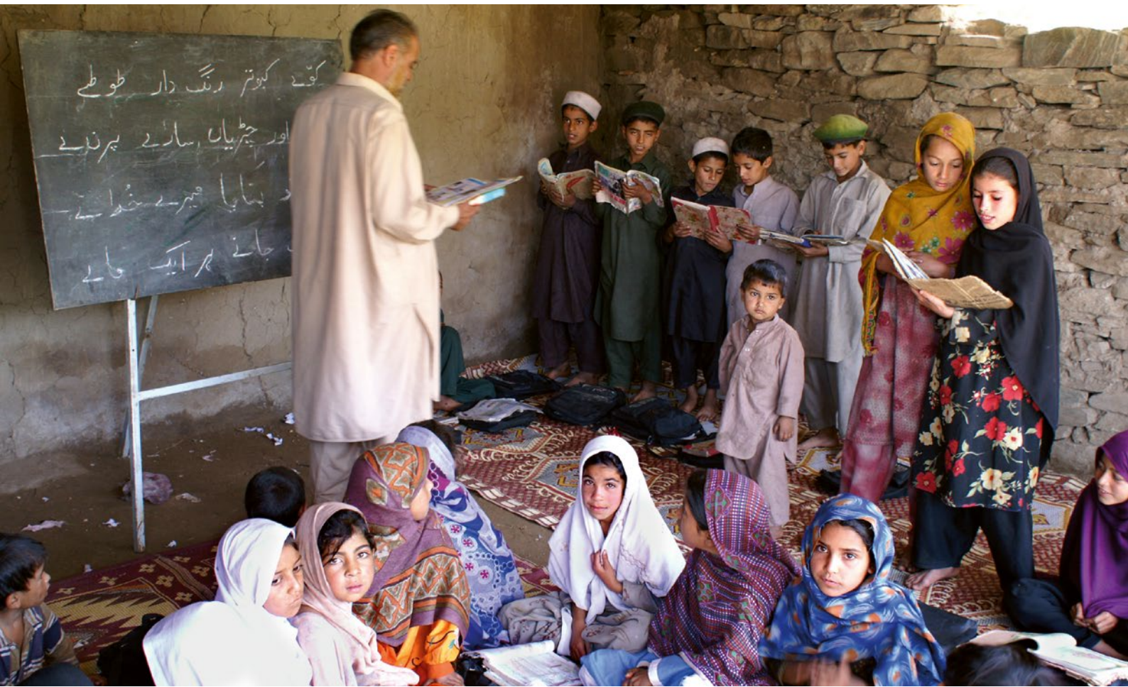
The Federal Government promotes the human right to education all around the world.