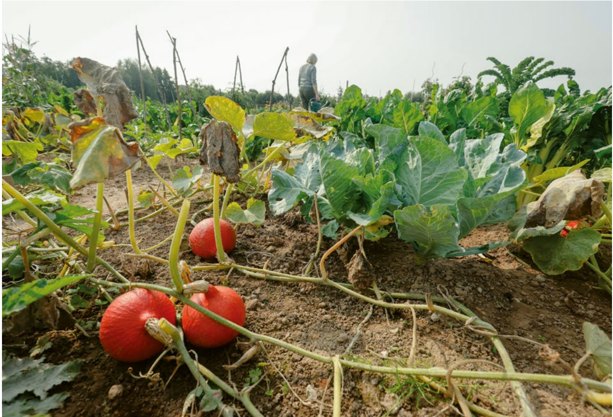
The Federal Government is promoting the transformation to sustainable and resilient agricultural and food systems.

gases and protecting biodiversity. At the same time, climate action helps secure production and realise the right to food, first and foremost for particularly affected small-scale farmers. Another aim of sustainable restructuring is to make local and regional agricultural and food systems less likely to be impacted by global crises and conflicts and – by adapting them in a better way to the climate crisis – to ensure that they can make a greater contribution to the local population’s food security. In order that these efforts do not give rise to protectionism, which in turn would lead to food shortages, the Federal Government is more strongly advocating for fair trade and the removal of trade restrictions, including non-tariff trade barriers in global agricultural markets. This includes the realignment of supply chains, expanding sustainable and regional food production and reducing post-harvest losses.