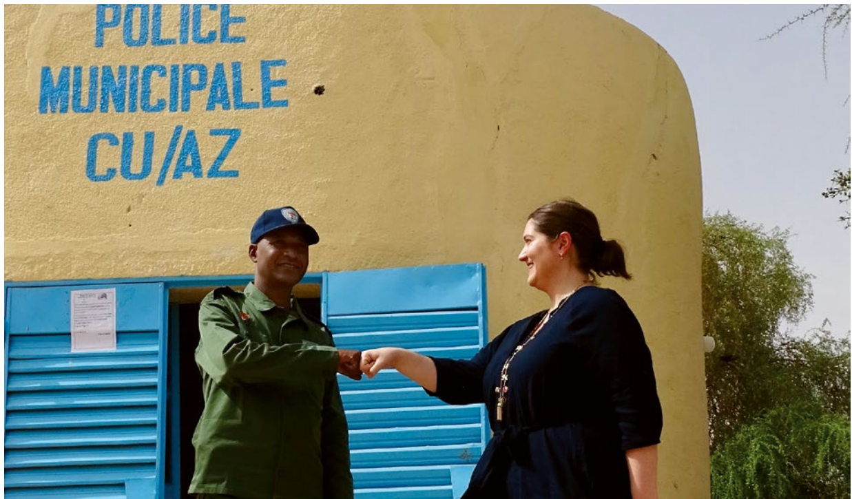
German civilian personnel and police staff are deployed as part of the EUCAP Sahel Niger mission in support of the Niger's security forces that are engaged in the fight against drug, weapon and human trafficking.

At all stages of a conflict, the Federal Government aspires to promote political processes leading to resolution and to create incentives for rapprochement and reconciliation with the help of our instruments. Our main focus here is on prevention, which we seek to achieve by addressing the structural causes of conflicts and strengthening peacebuilding actors. The Federal Government takes on responsibility for international crisis engagement under the auspices of its alliances and international organisations.