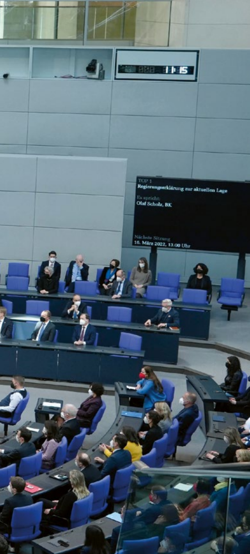
Plenary debate on the Zeitenwende in the German Bundestag on 27 February 2022

public services and resolve conflicts. Inequality is a key driver of conflict.