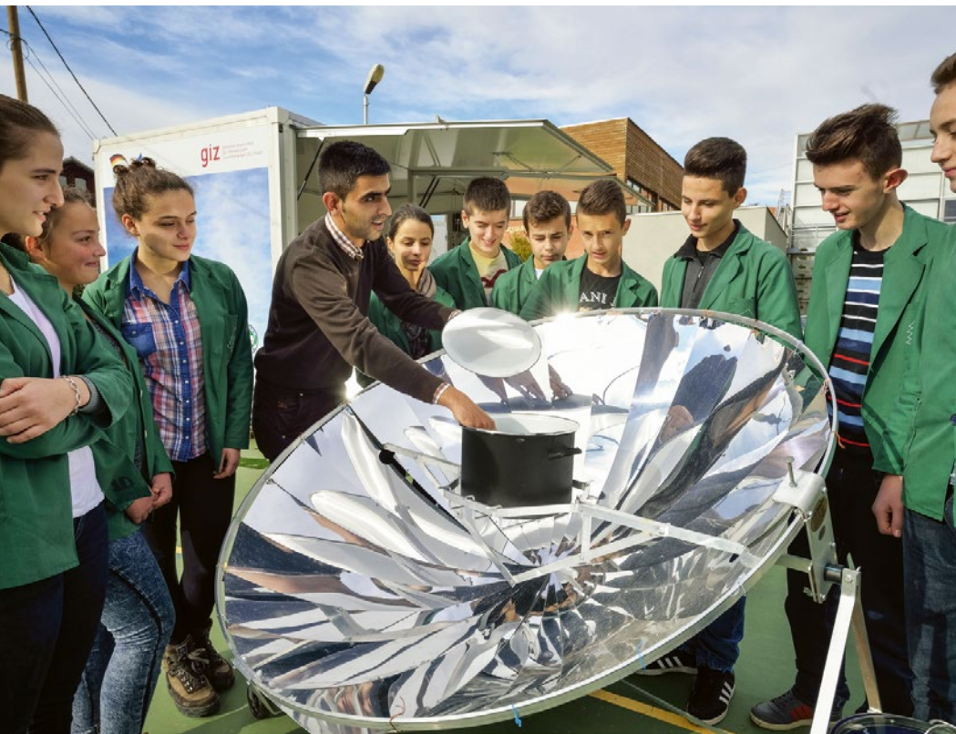
Pupils in Pristina learn how solar technology can be used to address the climate crisis.

Our global resources crisis requires a response on the part of all countries. The Federal Government therefore aims to find global and ambitious solutions. This includes a dialogue with all relevant actors. An openness to all technological possibilities makes it possible to ensure freedom of action, for us and for coming generations.