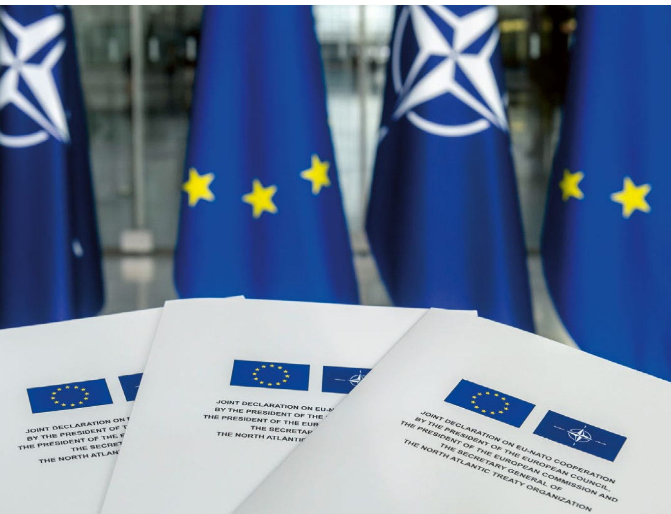
Joint declaration on cooperation between the EU and NATO