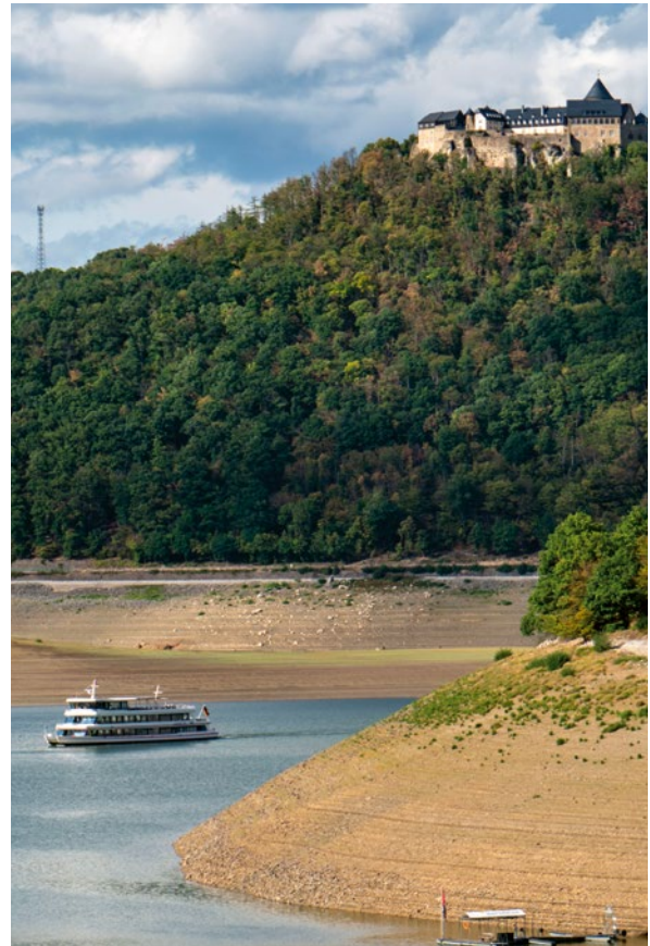
The impact of the climate crisis on people and the planet has become especially clear in recent years all around the globe – including in Germany.