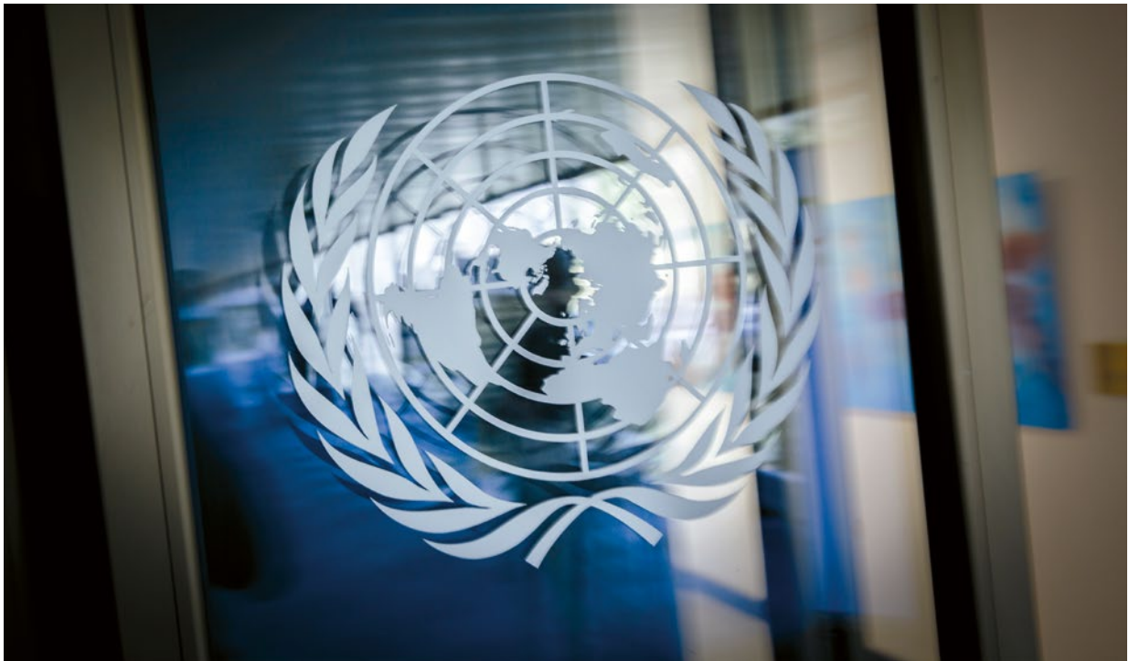
Germany actively supports multilateralism and the United Nations.

Germany states its commitment to multilateralism and to strengthening the United Nations. We are taking the 50th anniversary of our membership of the United Nations as an opportunity to further develop our comprehensive engagement in the area of UN policy. Germany is willing to shoulder global responsibility. We confidently embrace competition with states that are opposed to a free international order based on international law and the United Nations Charter. We take the consequences of systemic rivalry seriously and take them into account in our policymaking.