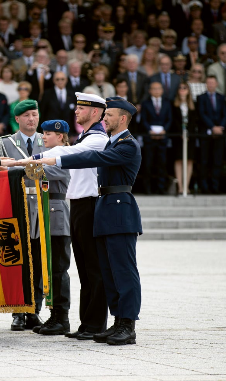
Bundeswehr recruits at their swearing-in ceremony